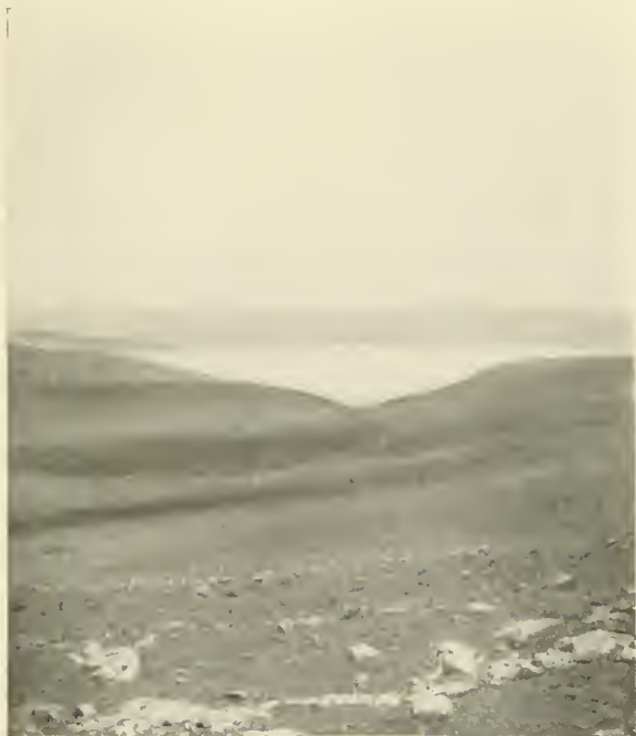
FIRST VIEW OF THE SEA OF GALILEE