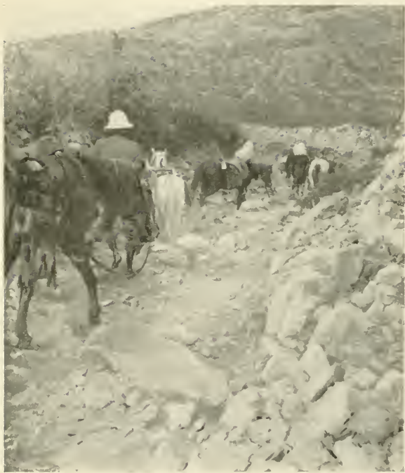
THE DAMASCUS ROAD OUT OF JERUSALEM NEAR BETHEL