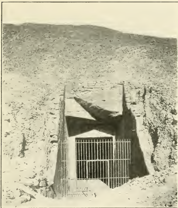
ENTRANCE TO THE TOMB OF SETI I., THEBES—NECROPOLIS