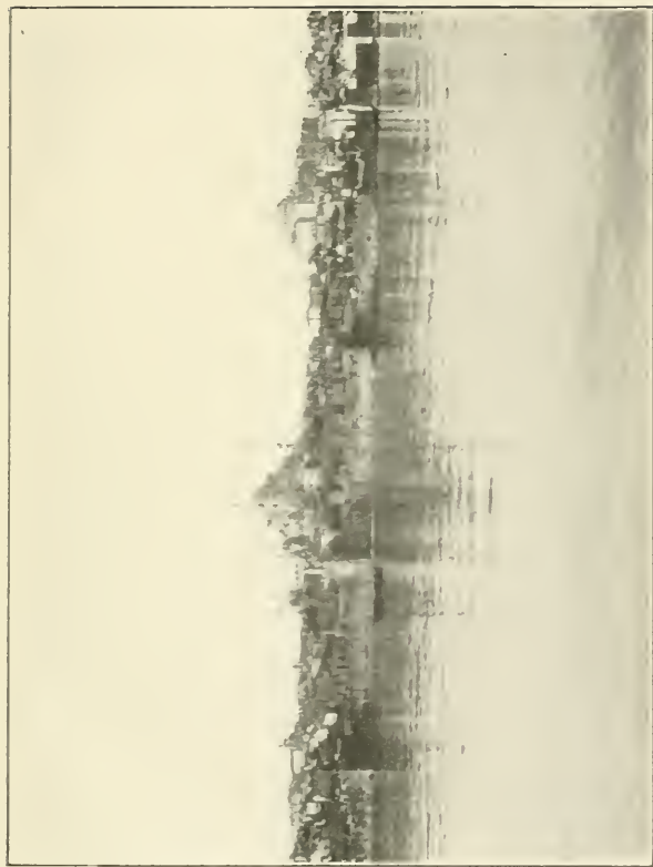
CONSTANTINOPLE FROM THE STEAMER