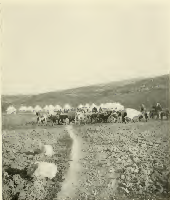
THE FIRST CAMP BETWEEN JOPPA AND JERUSALEM