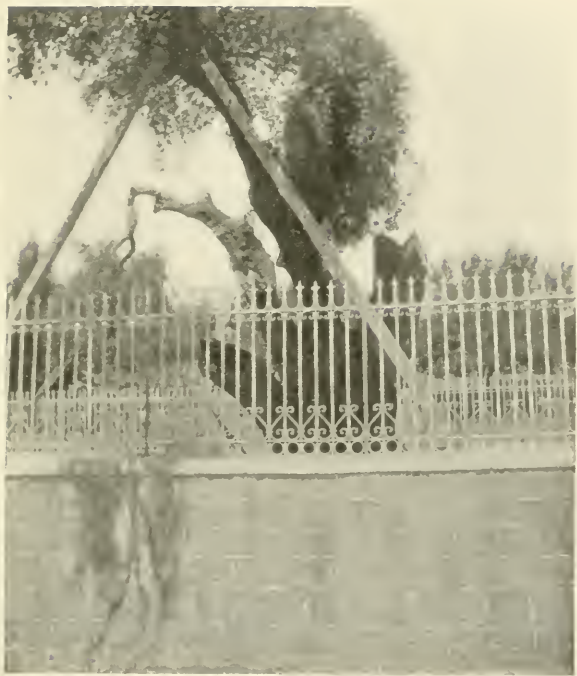
THE OAK OF MAMRE ABRAHAM'S OAK