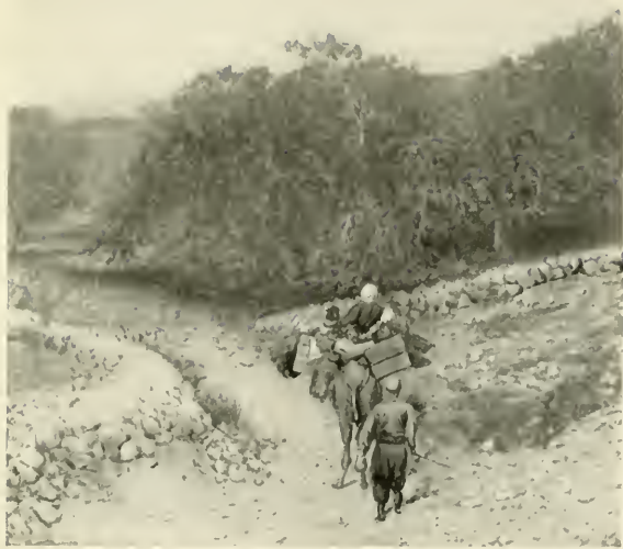
A FAMILY CARRYALL NEAR DOTHAN