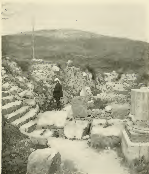
RUINS OVER JACOB'S WELL NEAR SHECHEM