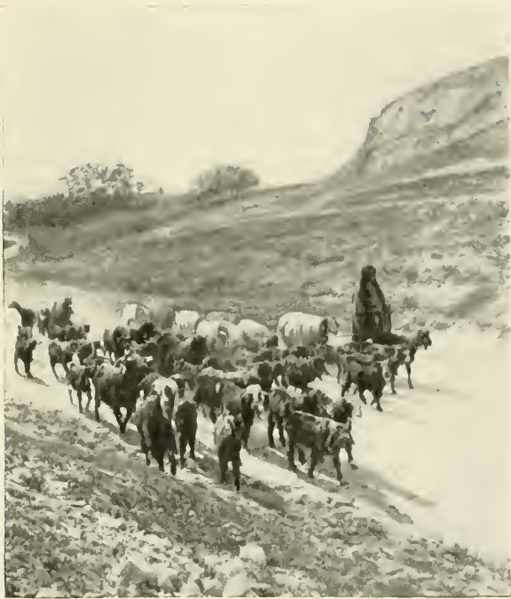
A GOAT HERD NEAR NAZARETH