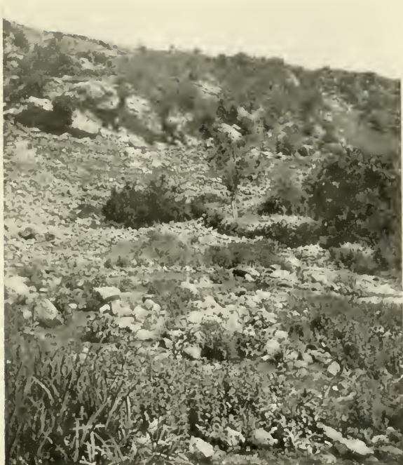
GROTTO OF PAN, ONE OF THE SOURCES OF THE JORDAN