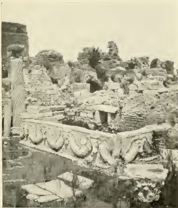
BULL'S HEAD BATH, OR FOUNTAIN AT EPHESUS