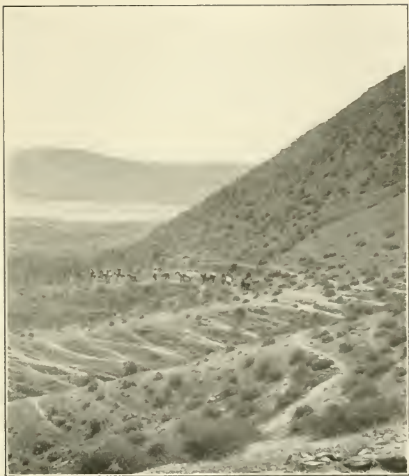
THE DEAD SEA AND THE WILDERNESS OF JUDEA