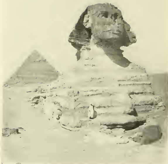
THE SPHINX AND THE PYRAMID