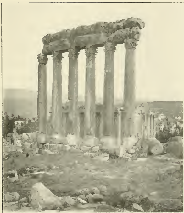
THE TEMPLE OF THE SUN, BAALBEC